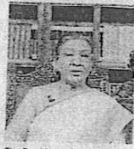
The President addressing the nation on Saturday, 26th

The President said that the decision to replace the