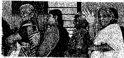
Women await their turn to vote at the school at Vennakara in Palakkad on Wednesday.

Although polling started at 7 a.m., the 184 booths spread across Palakkad municipality and the panchayats of Mathur, Pirayiri and Kannadi witnessed an