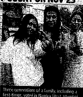
Three generations of a family, including a first-timer, voted in Randra West, Mumbai

► Of nine assembly seats in UP where bypolls were conducted, Ghazabad registered the lowest turnout — at 33.3%. This was the district's worst performance since 2007, when turnout was 33.03%.