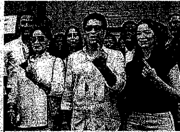
Former cricketer Sachin Tendulkar and his family display their inked fingers after casting votes for the Maharashtra Assembly elections in Mumbai on Wednesday.