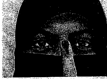
ஈ ஜனநாயக கடமையாற்றியதை பெருமையுடன் வெளிப்படுத்திய வாக்காளர். இடம்: மும்பை.

இதுபோலவே, மற்ற அமைப்புகள் வெளியிட்டுள்ள கணிப்புகளும், பா.ஜ., தலைமையிலான மஹாயுதி கூட்டணி ஆட்சி அமைக்கும் என்றும், காங்., தலைமையிலான கூட்டணி அதிக இடங்களில் வென்று, கடும் போட்டியை கொடுக்கும் என்றும் கூறியுள்ளன.