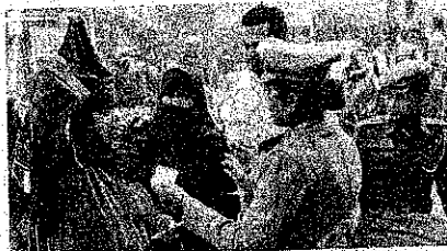
Tight security: A security official checks a voter during the Sisamau Assembly byelection in Kanpur district on Wednesday.

Posting a video on X showing Muslim women complaining that they had not been allowed to vote, Mr. Yadav called for the immediate suspension of a station house officer in Ibrahimpur who allegedly "used indecent behaviour and language with women to prevent them from casting their votes". In another post, he said, "All police of-