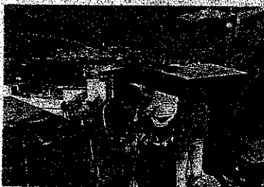
An elderly voter being assisted to a polling booth to cast her vote during the Kedarnath Assembly constituency bypoll in Rudrapur on Wednesday.

Bypolls in 15 Assembly constituencies and that of the Nanded parliamentary seat also concluded on Wednesday. In Uttar Pradesh, polling was conducted in nine constituen-