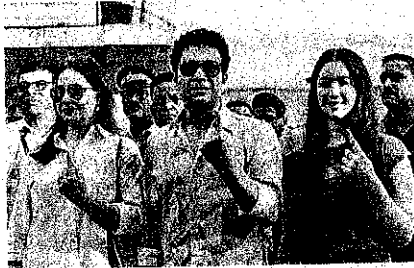
Cricket legend Sachin Tendulkar and family leaving a polling booth in Mumbai on Wednesday.

Voters will decide the fate of 4,136 candidates contesting in 288 Assembly constituencies. Votes will be counted on November 23. "Polling went off peacefully in the entire State, except for one or two incidents in Beed district,